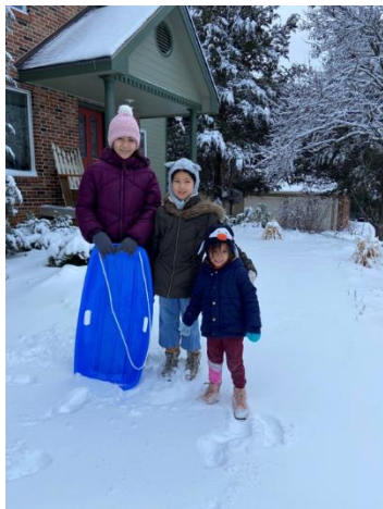
At least someone is enjoying this cold, snowy weather!

What a whirlwind the last year has been. The SCALes lab grown and has been hard at work on our projects related to crop diversity, rural resilience, and sustainable agricultural technologies. I was also happy to be a part of one of the awarded Game-changing Research Initiation Program (GRIP) transformational research projects this past year. The project offers an opportunity to integrate spatial data issues into the core of an artificial intelligence-based system for sustainable wheat supply chains. This past year has also