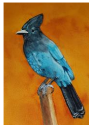
“Steller’s Jay” (watercolor)