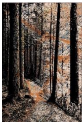
“Fall Path” (photo collage)

If any of you want to get in touch, please do! My ksu email still works, and from there I can provide other means (Gmail, etc.). Have a great 2024, and I hope a number of you can make it to AAG in Hawaii!