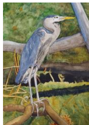
“At the Edge” (watercolor)