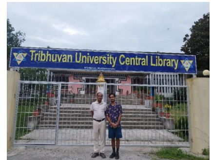
In front of Tribhuvan University Central Library with a Computer Science Student.

In summer of 2023, I completed five months staying in Nepal as a Fulbright Flex Fellow. My hotel is in the heart of Kirtipur close to the Tribhuvan University campus. From my hotel to the campus was five-minute walking distance. In addition, I walked almost every evening in the campus and/or surrounding areas of my hotel. Most of the Newari people of Nepal live in Kirtipur. Gautam Buddha was born Newari clan. Although they are Hindus, they equally respect Buddha and Buddhists. There are numerous Buddhist stupas and temples in Kirtipur. However, the summer temperatures were relatively nice – it was not too hot compared to South Asian countries or even Kansas. I conducted three field trips in rural areas in the two districts of the country. Academically, the 2023 was not as productive as the years before. On the family front, all our three children have been living and working in Kansas City areas. Our elder daughter has a dog (Kai) and younger daughter has three dogs (Pepper, Peanut, and Gus). We visit them at least once in a month.