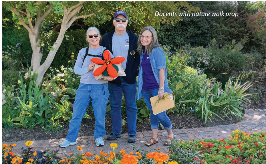
Docents with nature walk prop

✿ Plan to attend the annual Garden Party on June 7, 2024, from 6:30-10 p.m.